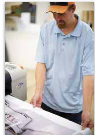
Inexpensive scalability for growing shops